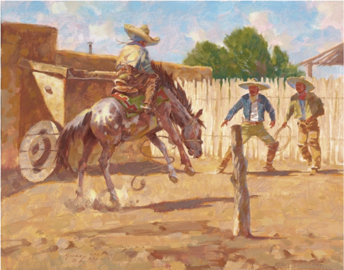
Taming the Wild Breed , oil, 16 x 20"