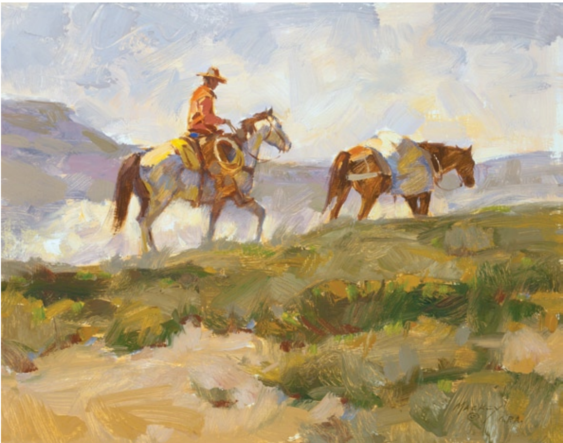
Up Hill , oil, 8 x 10"