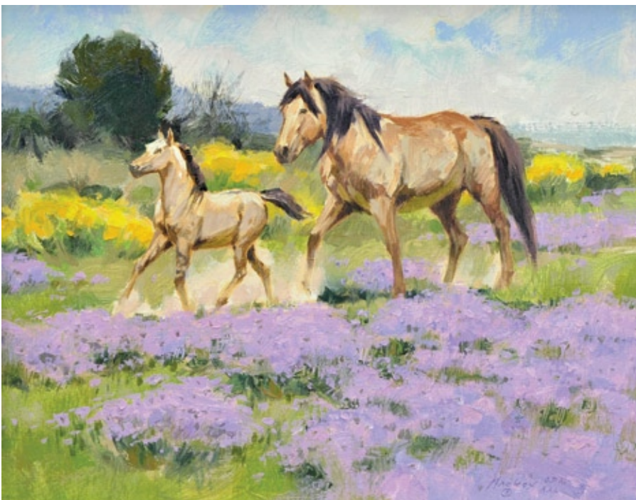
Mustang Mom , oil on canvas, 11 x 14"

research on his subject matter before beginning a painting.