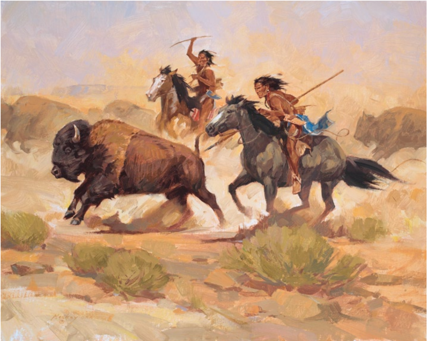
Closing , oil on linen, 16 x 20"