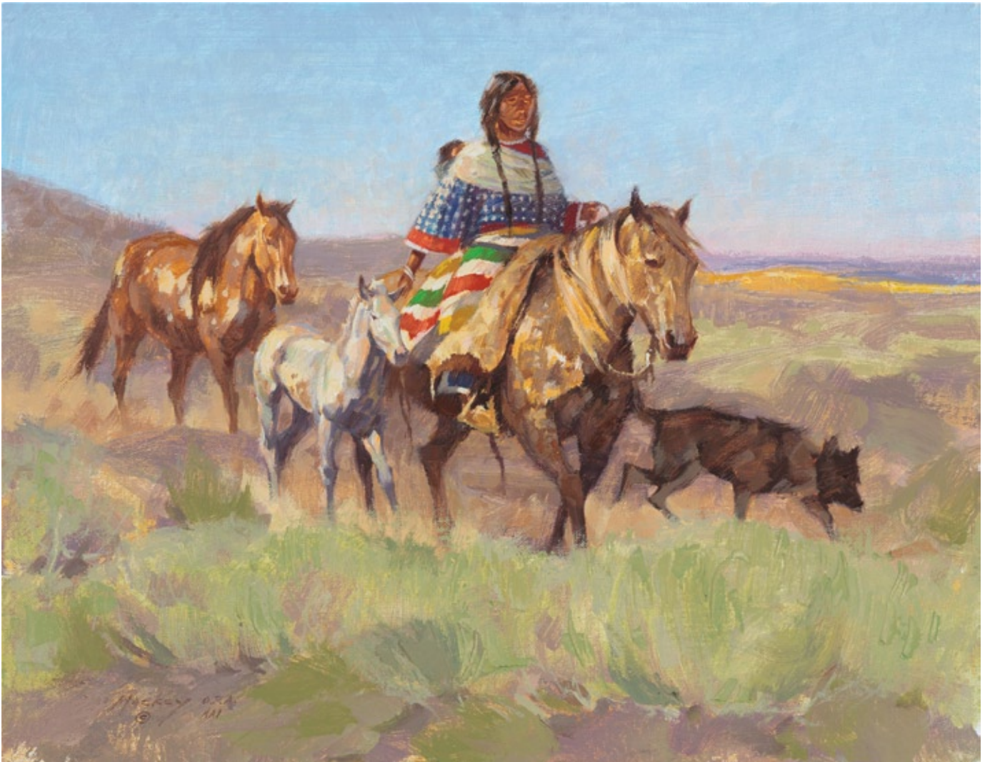
Head of Household , oil on canvas, 11 x 14"

traits that were the hallmark of the breed in Spanish Ponies .