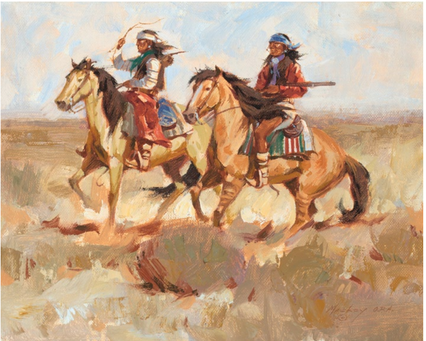
Spanish Ponies , oil on panel, 8 x 10"